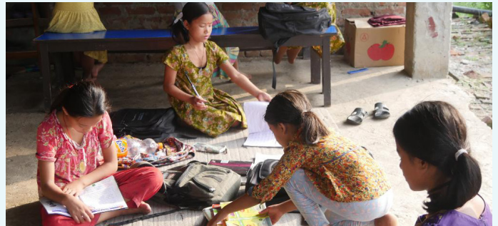
Some of the girls at the hostel busy studying.