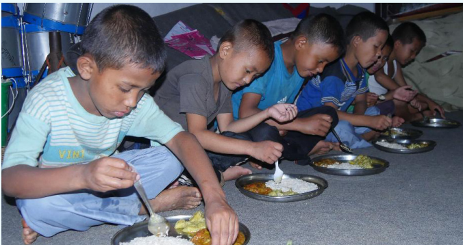
Boys having lunch at the Nuwakot residence.

At Nuwakot, another boys' hostel is being built, and the "bhoomi puja" (the traditional ritual to sanctify the land upon which a new building is to be constructed) has been completed for work to begin on the construction. This project is supported by Sewa UK funds. At present, 19 boys are living in a temporary residence, and once the hostel building is completed 50 boys can be housed in it.