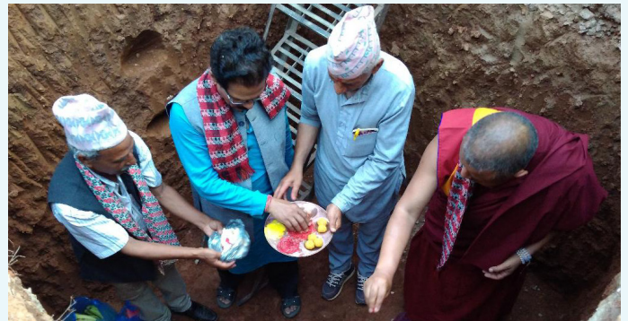
The "Bhoomi Puja" for the Nuwakot hostel.