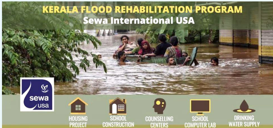
A Sewa report prepared for the Kerala Flood Rehabilitation Project