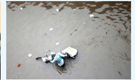
A man pushing his bicycle in flood waters

The rains have paralyzed infrastructure. Tens of thousands of cotton and millet farmers have been affected. Ahmedabad International Airport had to divert many flights due to flooded runways. More