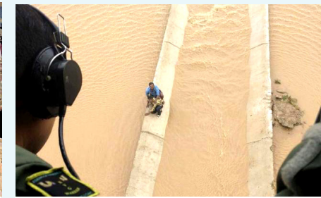
IAF personnel to the rescue