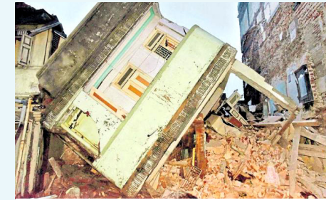
Rains collapsed a building in Ahmedabad

The floods in Gujarat, due to heavy rains and depression in the southeast, have played havoc with two million people directly affected. As of the last count 129 people have died; 800 villages have been inundated; 200 villages were without power; 17,000 were rescued; 20,000 were treated medically; 70,000 moved to safer ground; 112,000 evacuated to safety; and five national highways, 20 state highways, and 945 roads were closed to vehicular traffic. Rain continued to pummel the state.