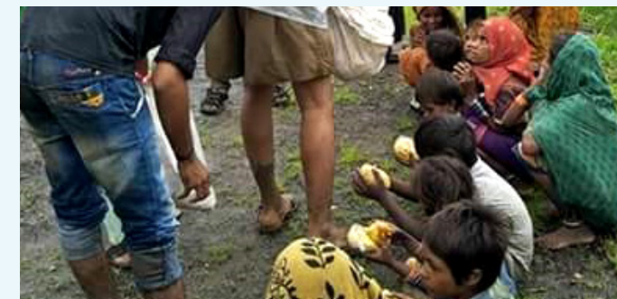
Volunteers serving food to the flood victims in Radhanpur, Banaskantha district, North Gujarat.