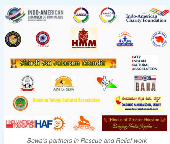
Sewa's partners in Rescue and Relief work

Recovery in Houston will take some time, and Sewa International is dedicated to keeping tabs on the lives of people who have been deeply affected and serving them in this time of need.