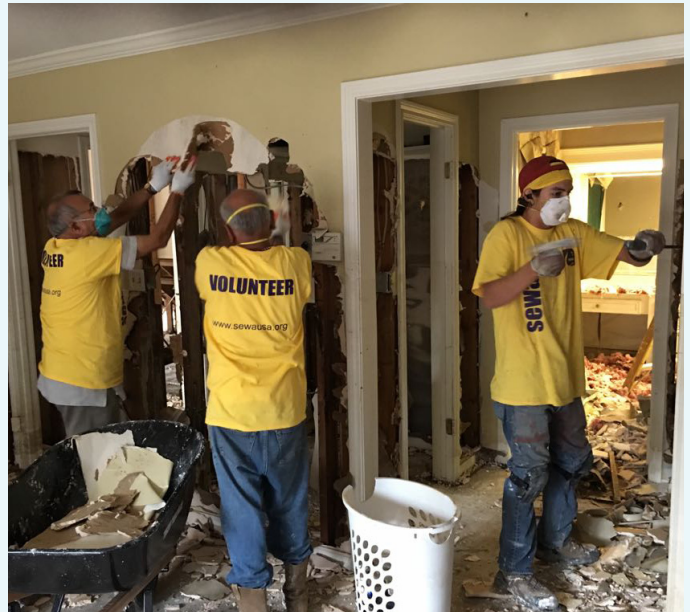
Cont. page: 3

Sewa International has coordinated efforts to bring together over 800 volunteers for the critical relief efforts, post Hurricane Harvey. Twenty-five national and local Indian-American organizations have partnered with Sewa as it was the only Indian-American organization first off the starting block and working on the ground at this scale. A hundred Sewa volunteers from its 41 chapters across the United States joined hands working remotely on the rescue and relief coordinating fund-raising, communication, social media updates, etc. As the rain and wind abated, volunteers have switched to providing relief to the hurricane's victims by organizing health clinics, cleaning the flooded homes, and providing hot meals by coordinating work with a network of partner organizations.