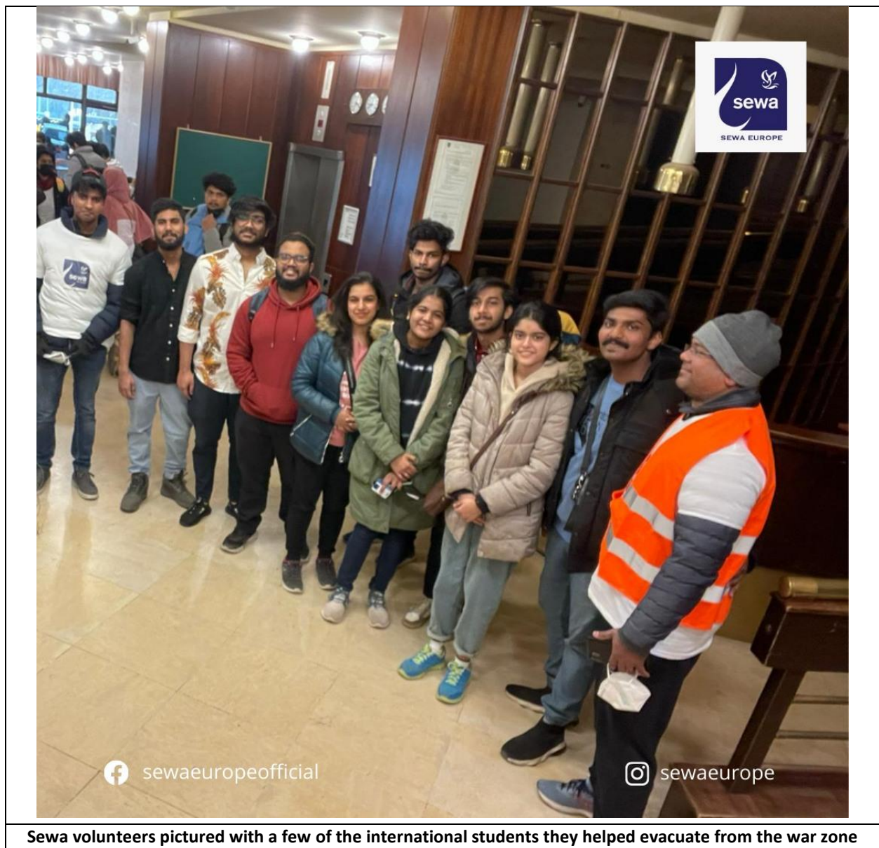
Sewa volunteers pictured with a few of the international students they helped evacuate from the war zone