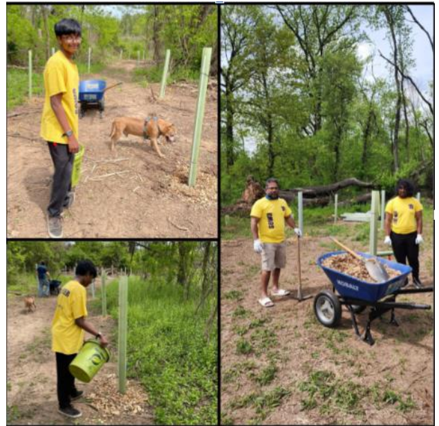
Sewa Reforestation Efforts

While it was physically taxing labor and long distance travel, the LEADs were able to gain knowledge, positive experience and skills from this event and were also able to enjoy a sunny day!