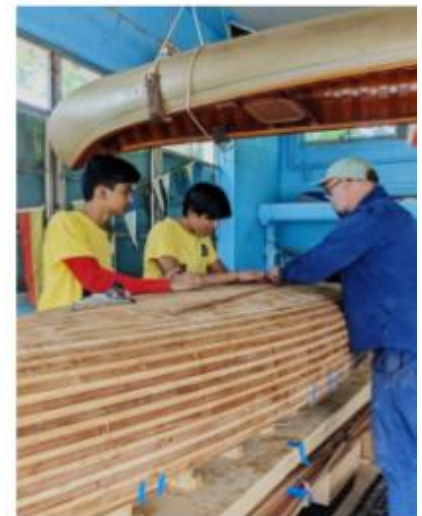
Sewa Boat Building for River Transport