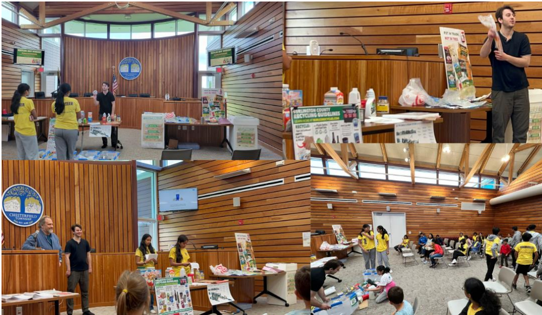
Sewa Recycling Right Workshop

The volunteers then further went on to make a huge contribution to the planet by planting 50+ trees in the township.