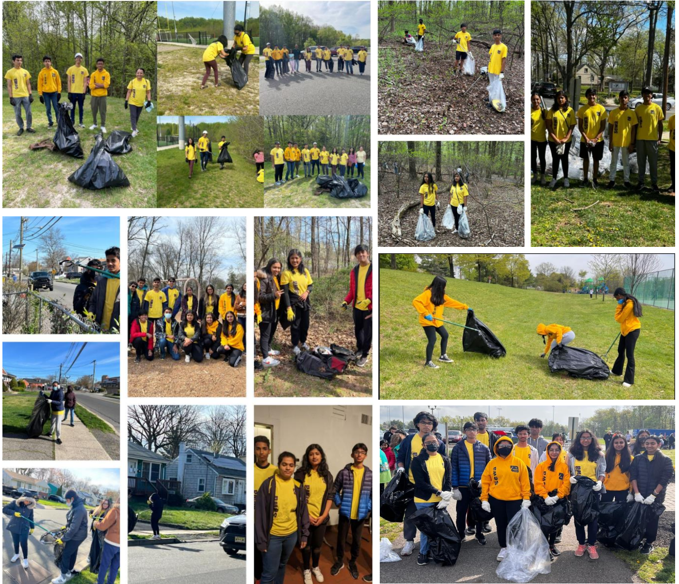
Park Cleanups by Sewa Volunteers

Central Jersey LEADs also volunteered at multiple cleanups to help restore Edison State Park, Colonia Park in Woodbridge, Papianni Park in Edison, Inman Park in Franklin Township, and Memorial Field Park at Mount Laurel township, NJ. LEADs worked together to pick up trash and debris that was left in the park and green space. They worked together on picking up litter such as water bottles, plastic caps, plastic bags, and other sorts of trash, sweeping paths, removing fallen branches and leaves, and disposing it all off in the right manner.