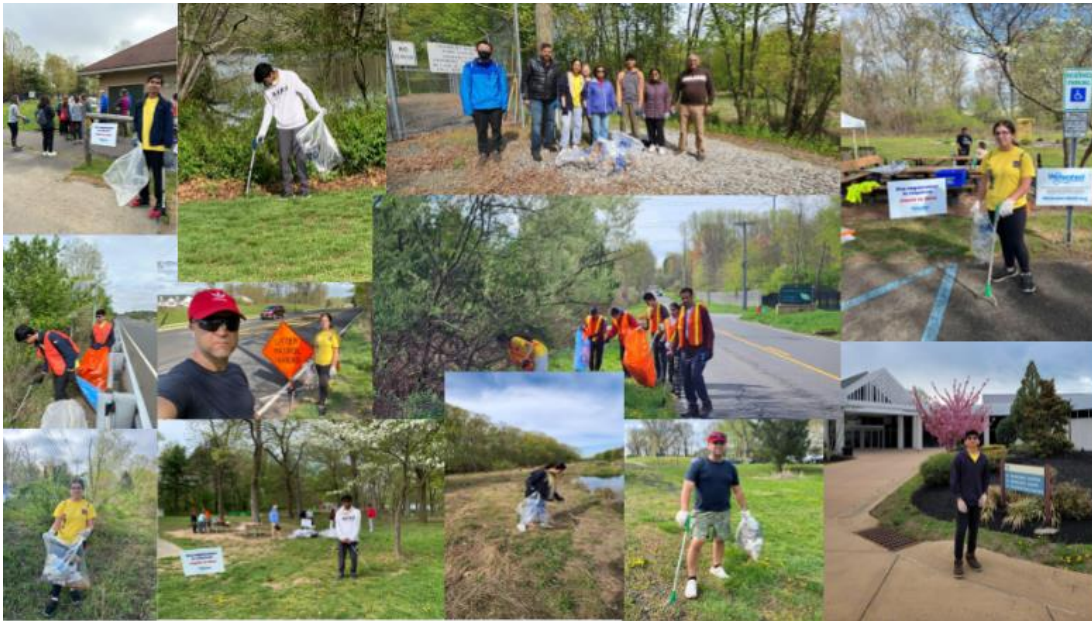
Road and Waterways Cleanups by Sewa Volunteers

LEADs helped at different locations including Ewing, Monroe, East Windsor, and the Plainsboro Preserve. LEADs at Ewing and East Windsor collected a lot of small and bulk items that could prevent proper drainage in the stream or could block the water flow. LEADs at Monroe Community Garden also collected about two bags full of garbage. Volunteers at Plainsboro Preserve worked on Scudders Mill Road picking up trash and recyclable materials filling up a total of four garbage bags. They also learnt to promote reforestation and conservation of natural resources.