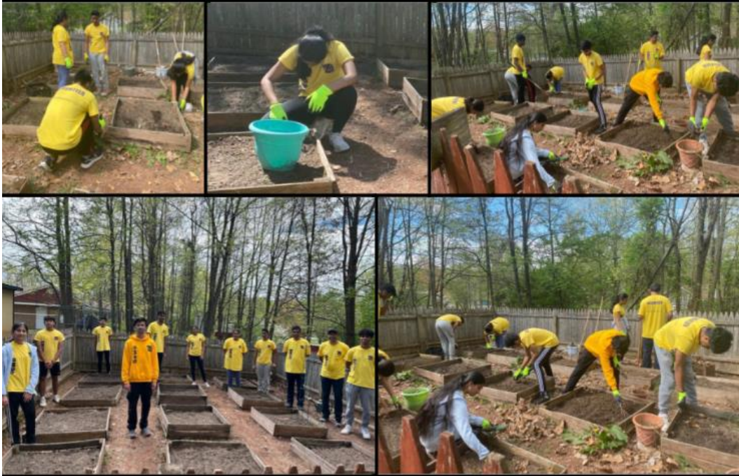
Community Gardening by Sewa Volunteers

Chapter LEADs have also been volunteering at Kiddie Keep Well Camp Garden in Edison and at the Marlboro Community Garden. At the KKWC garden they helped in cleaning, weeding, and watering the 15 garden beds. The fresh organic produce obtained from the LEADs' efforts at the garden will be used in the KKWC kitchen to feed the unprivileged children attending these camps. At the Marlboro Community Garden LEADs prepped for the upcoming season by weeding, sifting compost, dispersed wood chips, and distributed soil in the different plots. As always they ended the volunteering session with a learning session with the head Gardener, where this time they learnt about planting and maintenance of Dahlias.