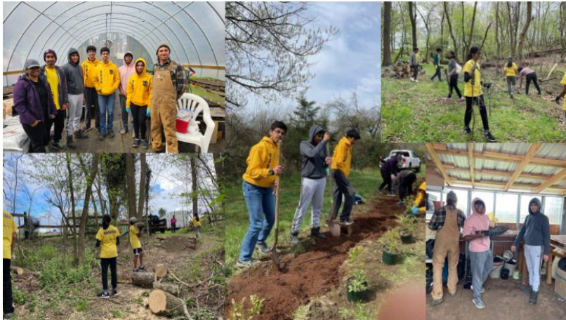
Organic Farming by Sewa Volunteers

LEADs also helped the farm to recover from a recent storm. The picture below showcases the youth volunteers in action, cleaning up walking trails by moving fallen tree branches out of the way. In addition to this task, the group also helped fill approximately 450 small containers with soil so that the farmers could be ready for potting the baby plants. Thankfully, with many helping hands working together, the trail was restored and in good condition.