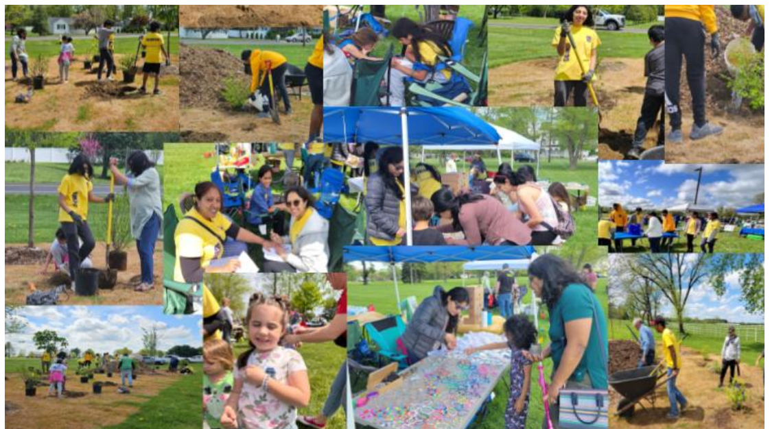
Sewa Volunteers Tree Planting and at Green Fun Fair