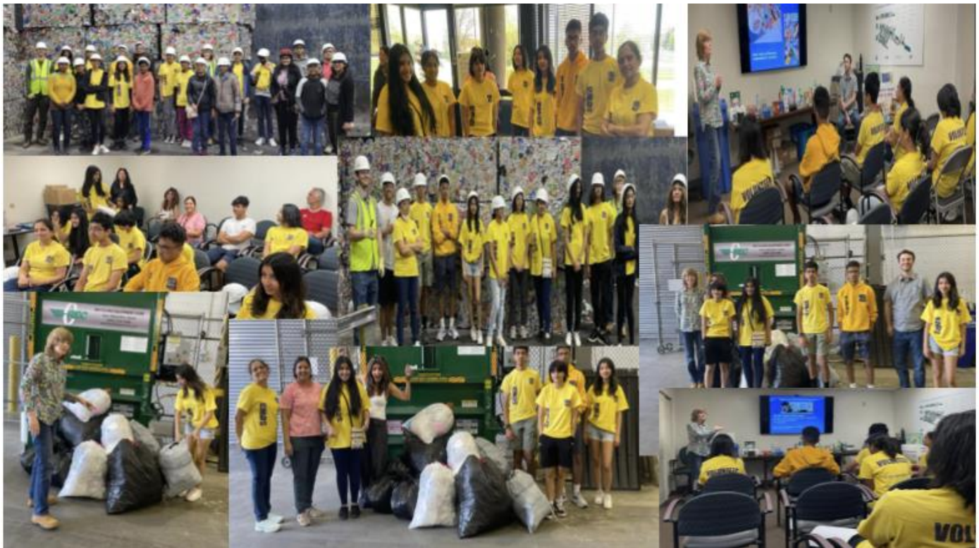
Sewa Recycling Tour & Workshop

This aim of the recycling tour by the Chapter was to educate and encourage all to do our part in recycling right & keep our towns clean. LEADs learnt that recycling helps us not add to landfills, conserve natural resources and protect the environment.