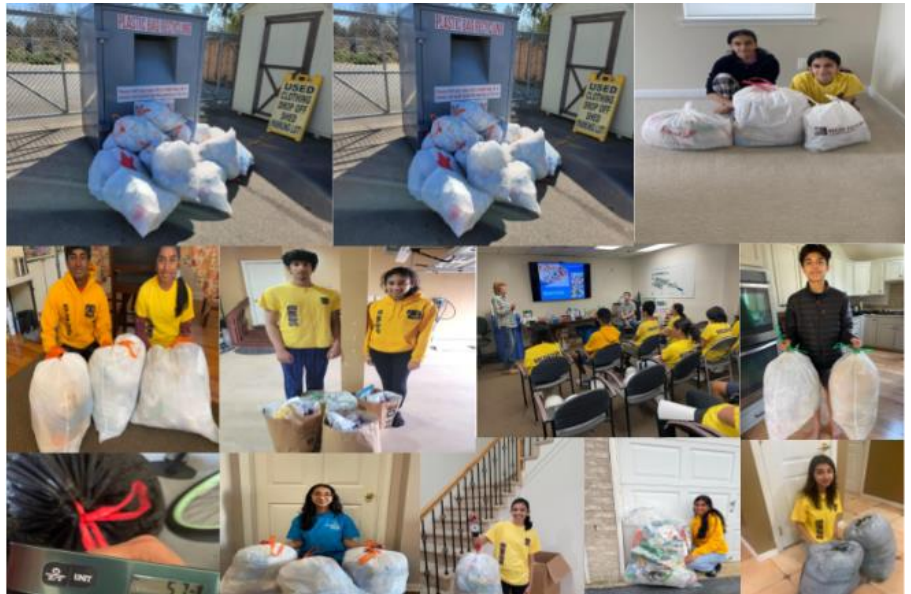
Plastics/Films Recycling Drive by Sewa Volunteers

LEADs have so far collected ~700 pounds in this recycling drive and will continue with this drive in the ensuing months. The collection so far was dropped off at the Chesterfield and Burlington County Recycling Centers.