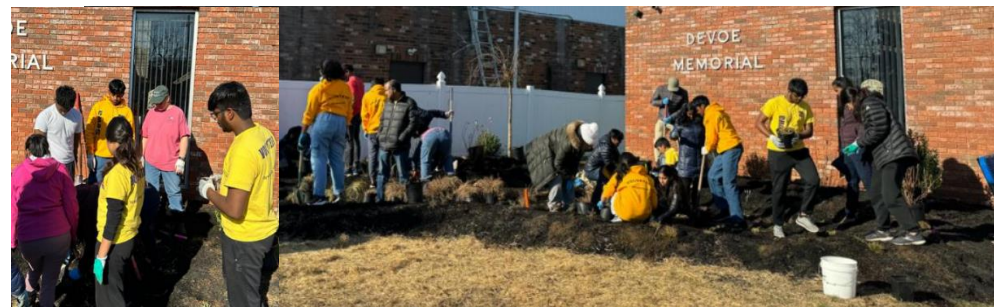
The affected area was dug out then the rocks were placed and the run off was redirected to the site of the rain garden, mulch was placed, suitable native plants and shrubs were brought in and a rain garden was created.

The chosen site was experiencing a stagnant flood situation due to runoff water, prompting the launch of a rain garden initiative. 30+ Chapter LEADs and adult volunteers gained essential knowledge and skills from master gardeners, leading to the implementation of the solution - the establishment of a rain garden. This pilot project was done in support of a township library in Middlesex County and was done under the supervision by Rutgers University.