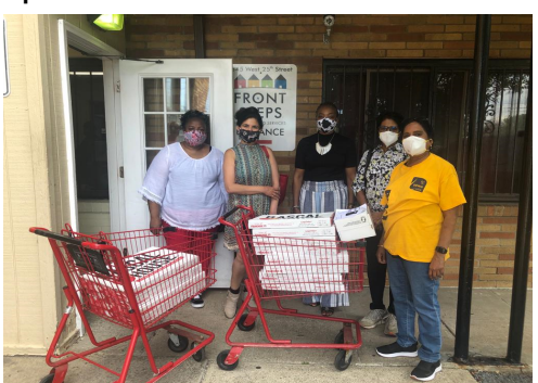
Front Steps Shelter