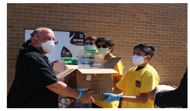
Menorah Park Nursing Home Beachwood

https://www.news5cleveland.com/news/continuing-coverage/coronavirus/local-coronavirus-news/local-teenagers-3d-printing-hundreds-of-face-shields-for-frontline-workers