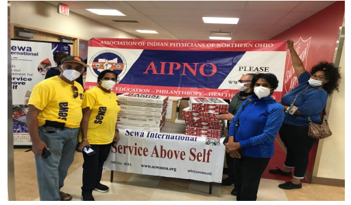
Zelma Homeless Shelter