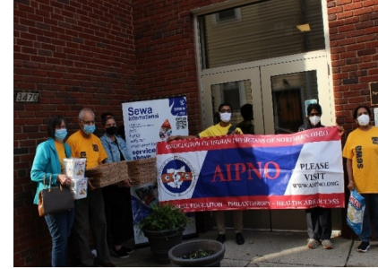
Family Promise Shelter