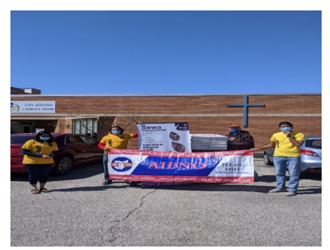
Laura Homeless Shelter

Sewa also distributed 150 pairs of new sneakers with the help of TANA