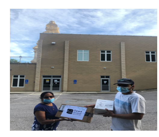
Rotary Club, Bhutanese Refugees, Grocery Stores