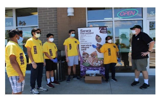
Antonio's Pizza, Solon, Ohio