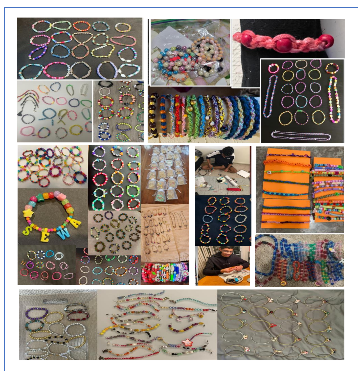
LEADs are next eagerly looking forward to selling these well-made durable jewelries in the spring, summer, and fall fairs in the coming year where they will set up a Sewa International booth to sell these beautifully made items and also give them an opportunity to talk about Sewa International and all its humanitarian causes.

The Chapter truly appreciates the tremendous effort and commitment of the LEADs. It's heartwarming to know that their efforts will make a positive impact on the communities across NJ and further fund the great causes of Sewa International, USA.