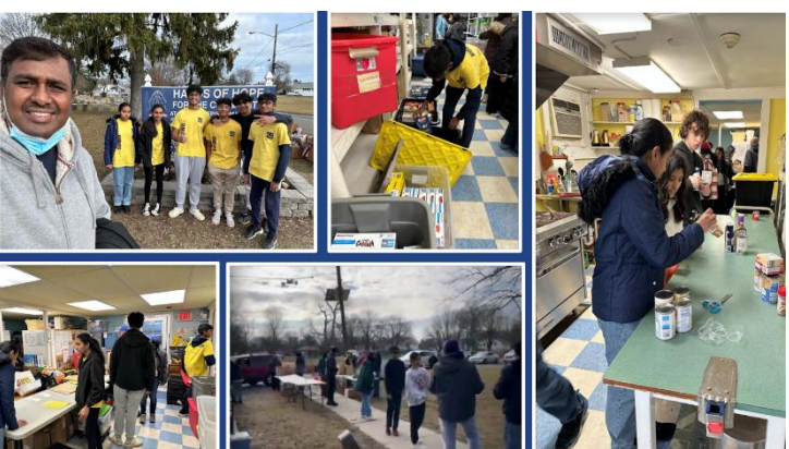
Chapter LEADs volunteered at the Franklin Food Bank in January where they helped sort donated food items, organize and restock shelves, and load produce into bags. They further assisted shoppers at the food bank in their shopping.