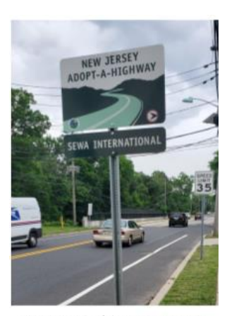
Sewa International sign put up on Rte 27 in Metuchen, by The NJ Department of Transportation in recognition of cleanup done by Sewa Central Jersey Chapter

This year too in the month of June, the Chapter stepped up and volunteered to clean up this stretch of the state highway.