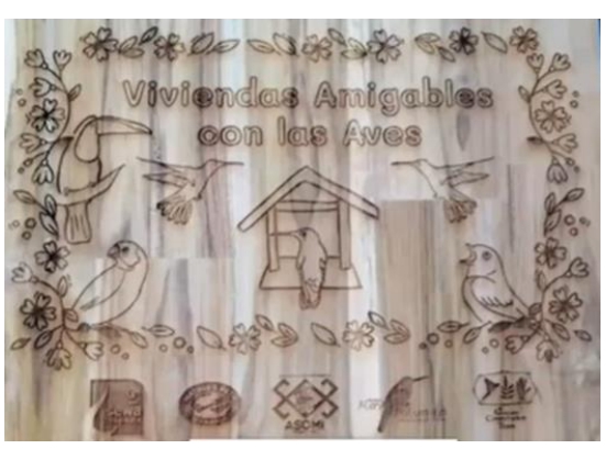
Top: Signs in front of homes indicating the homes as being environment and nature/bird friendly. The signs have been designed by the rehabilitated children. The logo of 'Sewa International' has also been incorporated in the design as an acknowledgement to the impact of 'Sewa' in their lives.