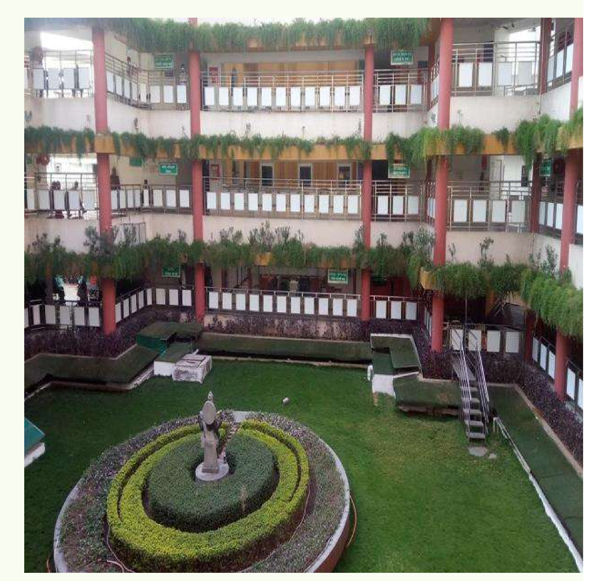
Dr. Hedgewar Multispecialty Charity Hospital in Sambhaji Nagar (Aurangabad)