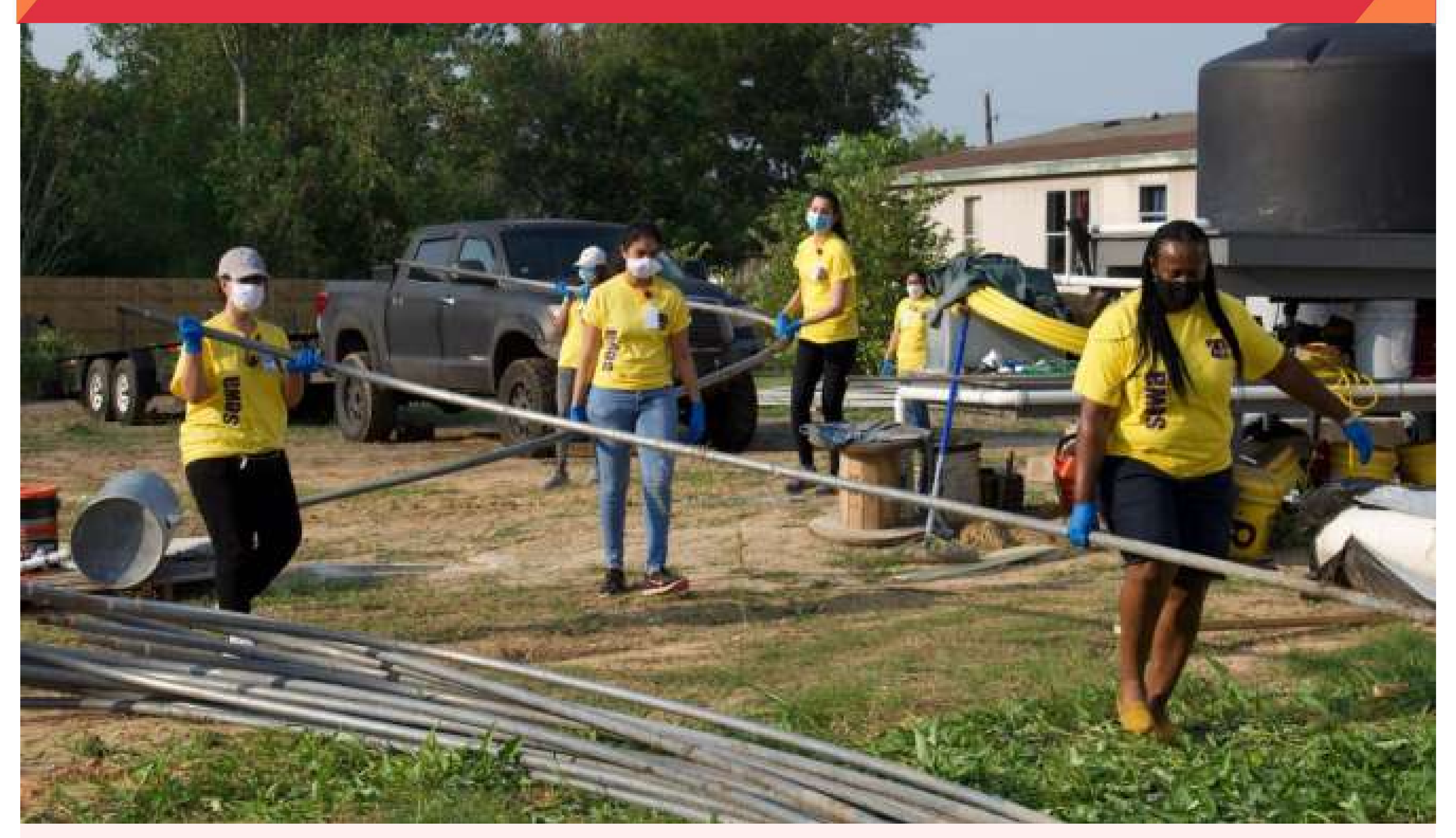
Sewa AmeriCorps Volunteers at work in Rosharon, TX. Sewa helped rebuild the Rosharon community after Hurricane Harvey hit Houston in 2017.

In its Partner Spotlight section of their 2021 annual report, OneStar Foundation has featured our Houston Chapter's AmeriCorps program. The report celebrates the resilience of Texas communities addressing the COVID-19 pandemic and winter storm Uri. The OneStar Foundation administers the AmeriCorps program in Texas.